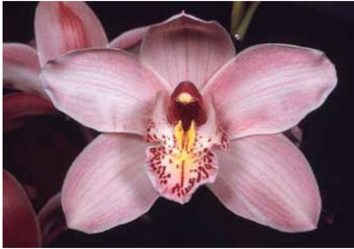
Cymbidium Lillian Stewart 'Monique', AM/AOS

BE AN ACTIVE PART OF THE MASSACHUSETTS ORCHID SOCIETY. VOLUNTEERING IS A GREAT WAY TO GET INVOLVED.