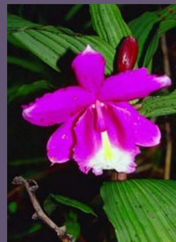
World's Tallest Orchid