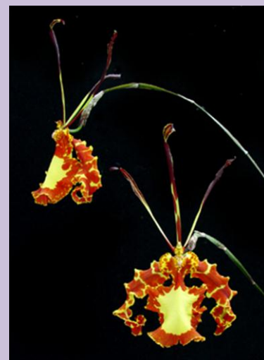
A Butterfly Orchid

What am I? Find out at the bottom of Page 4.