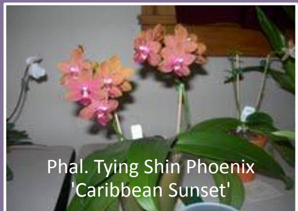
Phal. Tying Shin Phoenix 'Caribbean Sunset'