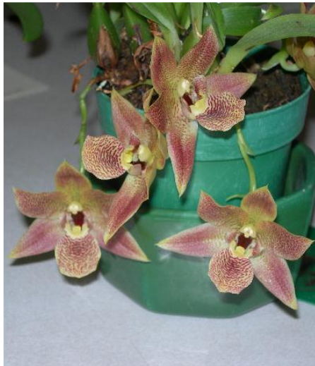
Prom. Limelight x Crawshayana 'Springtime'

In an effort to get our meetings started by 7:30, we kindly request that show table plants be ready for judging by 7:15pm.