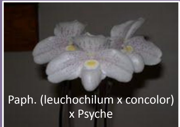
Paph. (leuchochilum x concolor) x Psyche