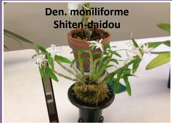
Den. moniliforme Shiten-daidou