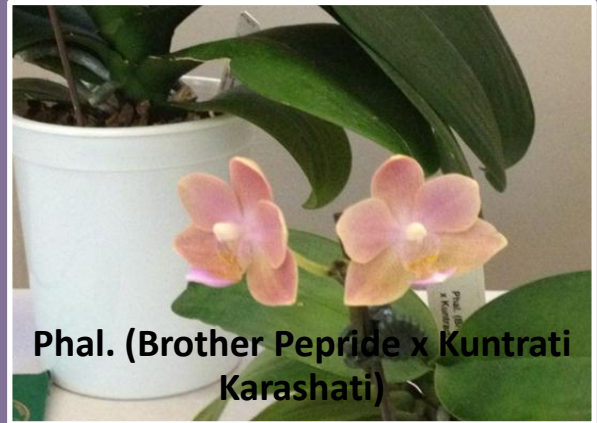
Phal. (Brother Pepride x Kuntrati Karashati)