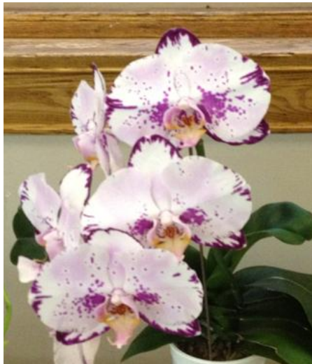
Dtps. Yupin Lady

In an effort to get our meetings started by 7:30, we kindly request that show table plants be ready for judging by 7:15pm.