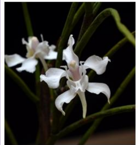
Flowering plant under cultivation

Renew by mail: Please mail a check made out to Massachusetts Orchid Society to Mass Orchid Society, PO Box 550141, Waltham, MA 02455