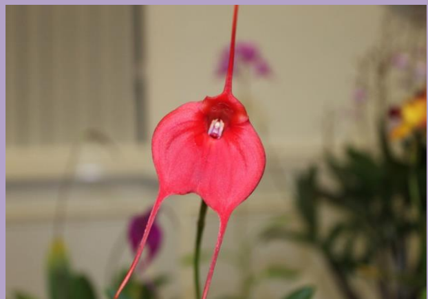
Masd. Redshine 'Sheila'