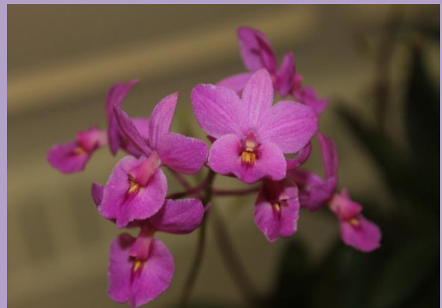
Barkeria (Terusan x Cyclotella)