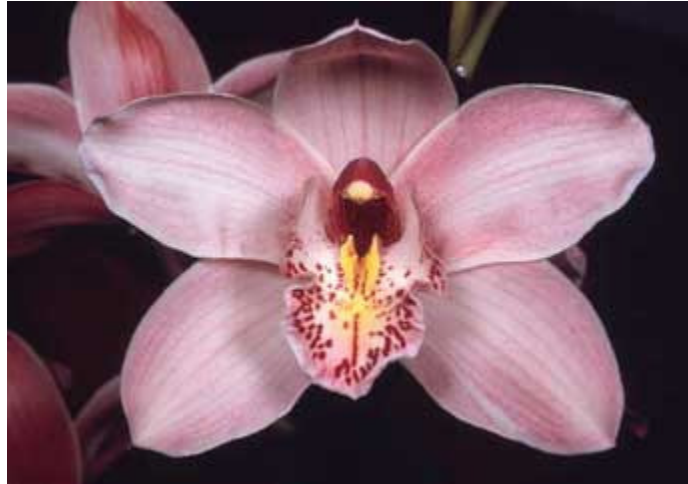
Cymbidium Lillian Stewart 'Monique', AM/AOS

BE AN ACTIVE PART OF THE MASSACHUSETTS ORCHID SOCIETY. VOLUNTEERING IS A GREAT WAY TO GET INVOLVED.