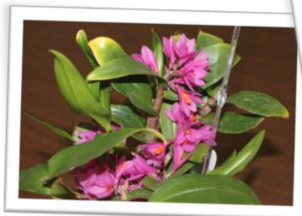
Dendrobium Hibiki 'Tiny Bubble'