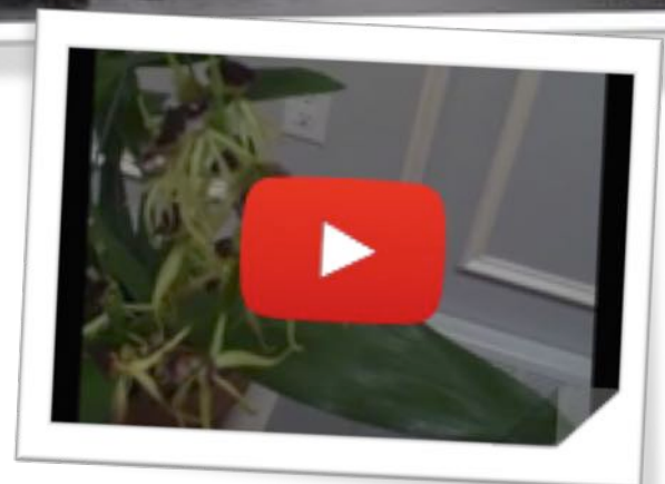
Right, a link to a video showing the show table from the Holiday Party. (Click the image, or go to this link. )