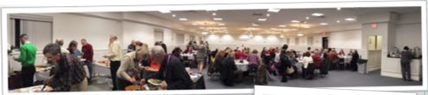
Above, the MOS 2015 Holiday Party festivities.