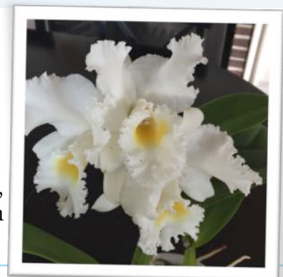
Cattleya Swan Lake, grown by Brigitte Fortin