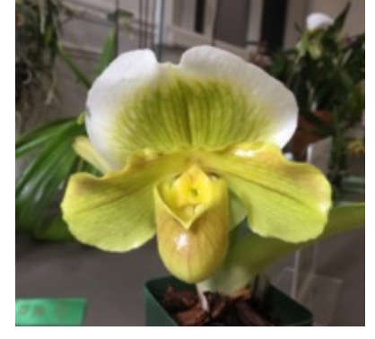
Paph. Irish Love Stone,