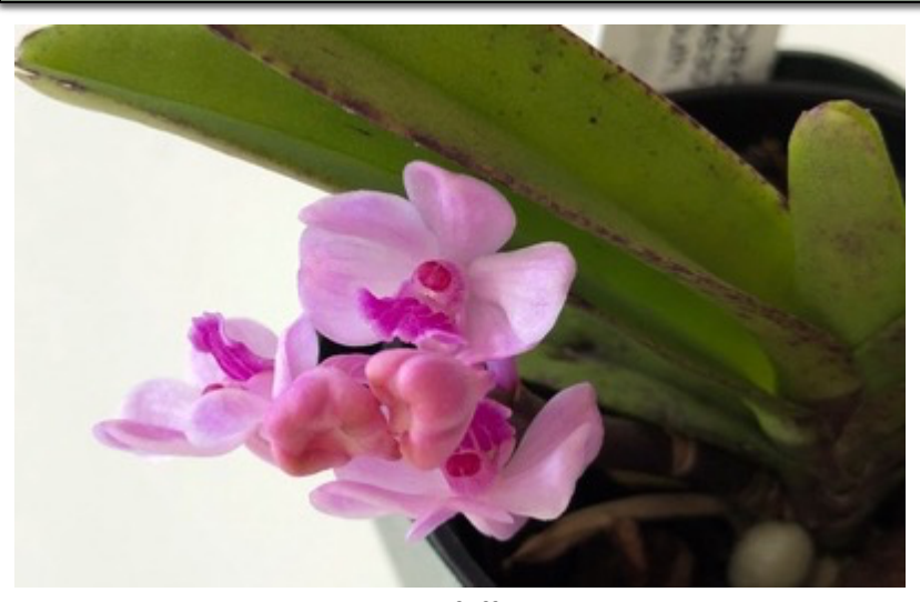
Vanda coerulescens