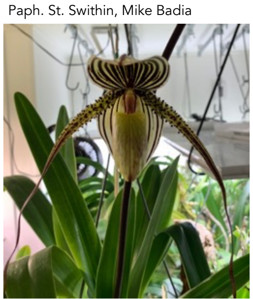
Phrag. Fliquet 4N, Brigitte Fortin