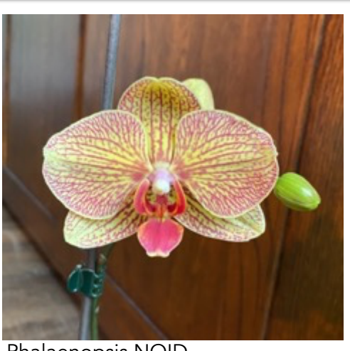
Phalaenopsis NOID (cf. Phal. KV Beauty), Emily Dewsnap