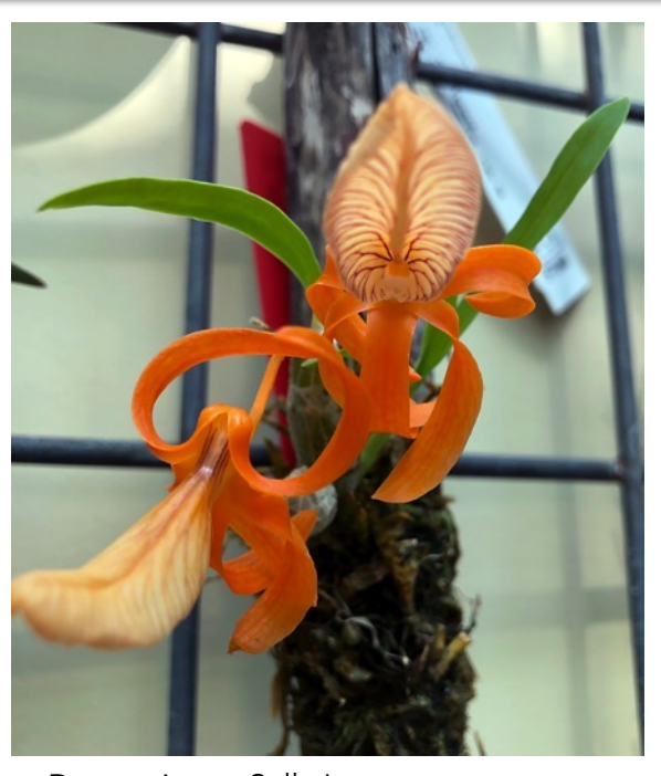
Den. unicum, Sally I.