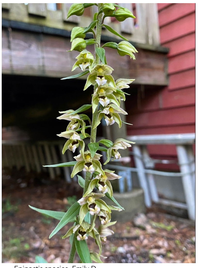
Epipactis species, Emily D.