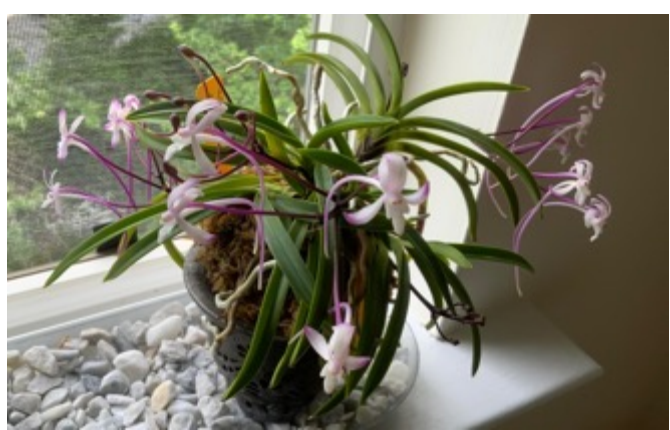
Phal. NOID, Virginia E.-M.