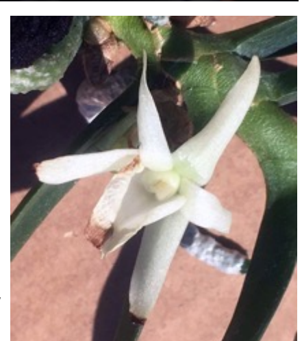
Angcm. dideri x sib