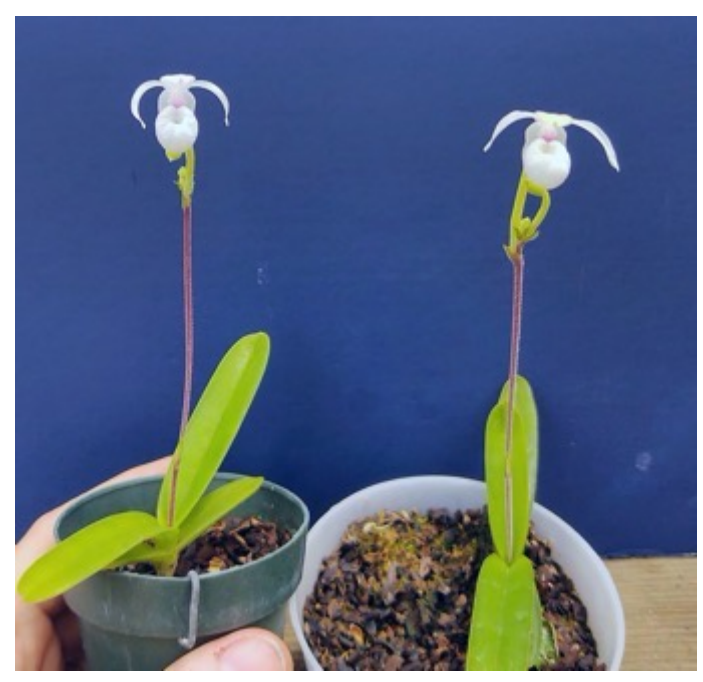
Mxdm. xerophyticum, Daryl Y.