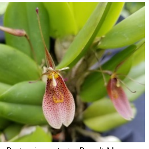
Restrepia contorta