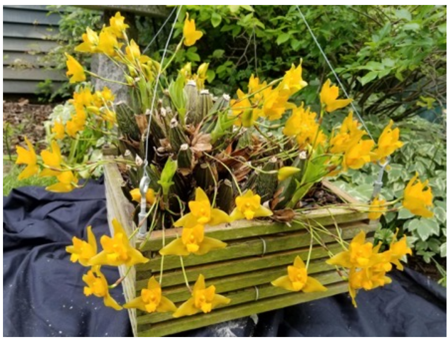
Lycaste aromatica