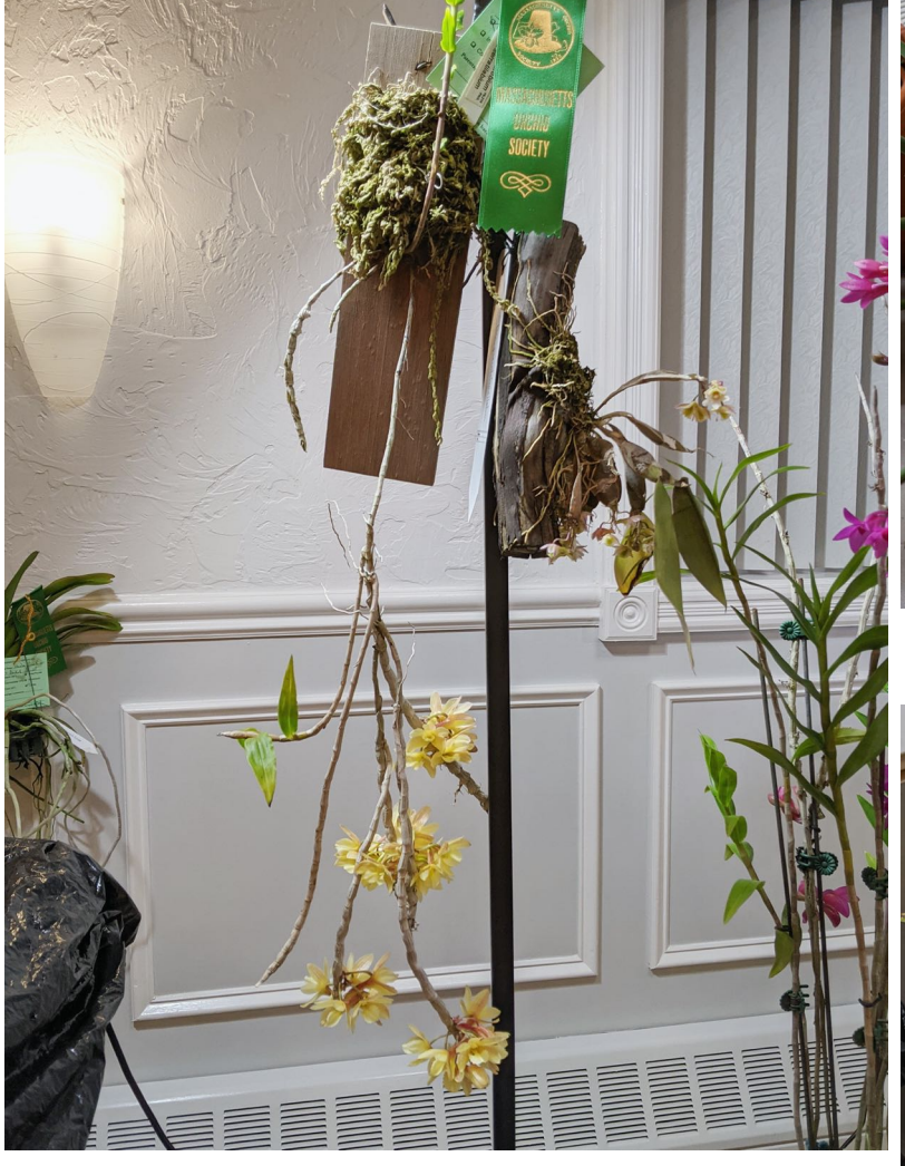
Den. serratilabium, Daryl Y.