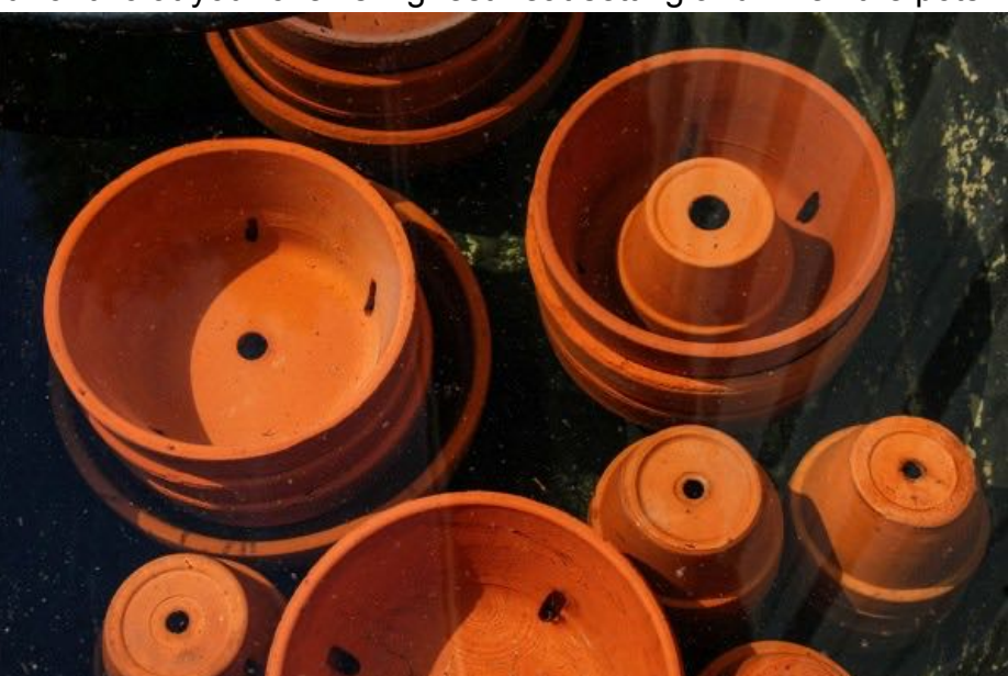
your pots will look Pots in the final soak after heat treatment. The pots look almost brand new brand new without and are ready to return to duty. using chemicals like bleach or acid.

are cool enough, place them in the sink and fill the sink with water for a brief soak. Best to use this alternative when the house is open and vapors can be dispersed easily. The fumes are similar to those you get when you put the oven on a self cleaning cycle. You'll have to ventilate to get rid of the fumes, but your pots will look brand new without