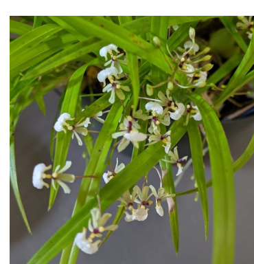
Gomesa radicans, Daryl Y.