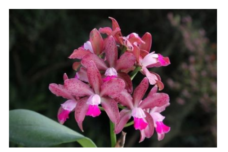
Cattleya Sue Bottom 'St. Augustine'

10. All your friends want divisions. The ultimate compliment is when friends come into your growing area and say I'd love a piece of that whenever you divide it. It means you've grown the plant to its maximum potential and gotten it to produce beautiful blooms. Do share your divisions with friends, it is one of the joys of gardening in general and growing orchids in particular. And who know, someday you may be asking for a piece of that plant back.