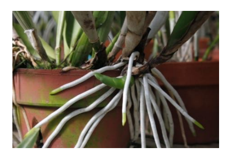
Cattleya Out of the Pot

When your plant is growing well, it is throwing off new growths, more leaves on a phalaenopsis or vanda, more pseudobulbs on a cattleya, more canes on a dendrobium, etc. With each new growth, comes the potential for new blooms. Dendrobiums are the exception, many will bloom from older growths, but cattleyas will only bloom from new