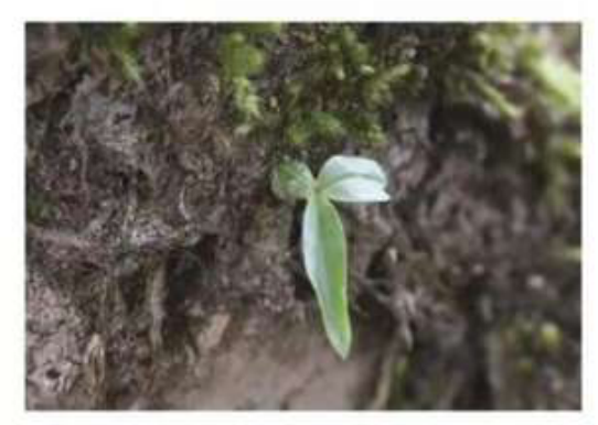
(D) Spontaneous seedling establishment

Orchid reitroduction in Xishuangbanna.