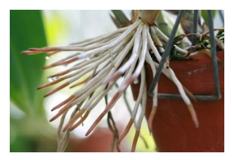
Long Root Tips

5. Plants in growth show long green (or red) root tips. You know you are a real orchid addict when you are just as excited about a new root as you are a new flower bud. When a plant is in active growth, it throws off new roots and the faster it grows, the longer the root tip.