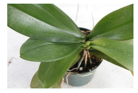
Phalaenopsis with Healthy Leaves

3. Your orchid has thick, turgid leaves. If your leaves look dehydrated, they probably are dehydrated and you'll have to follow the old tried and true advice, knock it out of the pot and look at the roots. If the roots are rotten, you'll have to repot and consider whether it was overwatering or late repotting that caused the problem. If the roots are still viable, you may have to increase your watering frequency and or the amount of water you pour through the pot when you water.