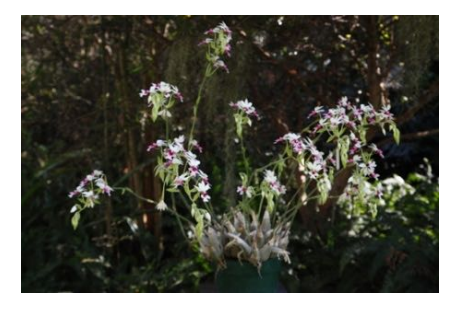
Calanthe Baron Schroder

growth, and somehow they always seem to bloom best when they're a bulb or two out of the pot. A monthly application of seaweed or kelp which contains some plant hormones will encourage new growths on your plant.