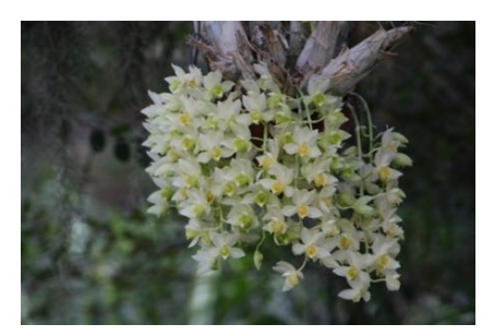
Clowesetum Jumbo Circle 'Clair' AM/AOS

8. Your orchids don't complain about being hungry. Orchids aren't like teenagers, they can't keep saying I'm hungry every couple of hours. Your orchids will grow fine with little fertilizer and many people proudly say they never fertilize their orchids. The real orchid food is light, but fertilizer contains the essential mineral building blocks for your plant. Get into a fertilizer routine. Use either water soluble or timed release fertilizer, whichever suits you better. Your orchids may not burp in appreciation, but you'll see an improvement in growth vigor.