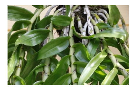
Dendrobium Golden Aya

4. Pseudobulbs and canes are plump. The canes and pseudobulbs on your sympodial orchids like the leaves on your monopodial orchids function similarly to the hump on a camel. They should be full of water and energy reserves to get your orchid through the dry spells as well as to make sure your plant has enough energy in reserve to develop flowers. After all, most orchids aren't grown for their foliage.