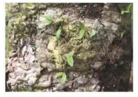
(A) Seed germination after reintroduction