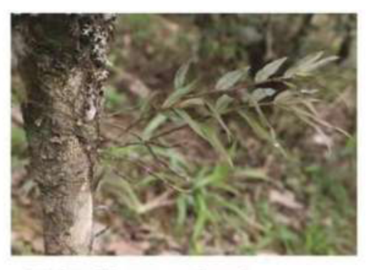
(B) Seedling growth and maturation