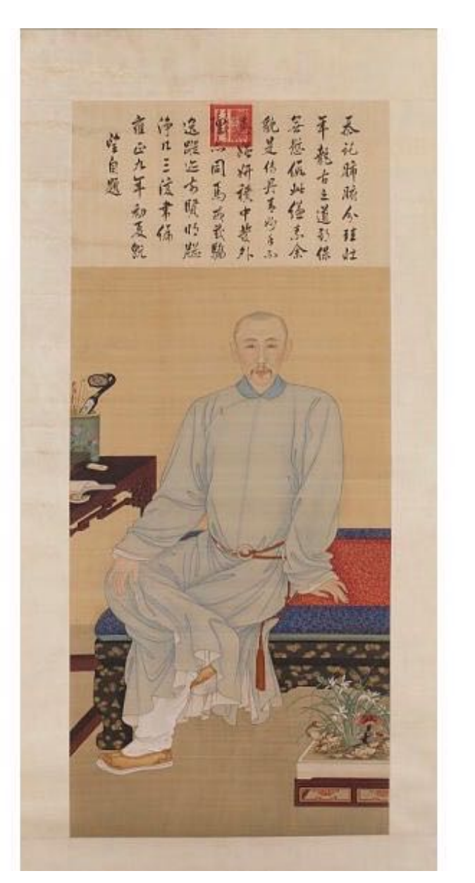
Purchase—Smithsonian Collections Acquisition Program and partial gift of Richard G. Pritzlaff (S1991.95) Probably by Mangguri (1672–1736), Yinli, Prince Guo of China, Qing dynasty, 1731. Ink and color on silk, 345 x 132.5 cm (135 13/16 x 52 3/16 in). The prince is painted seated next to a planter of cymbidium orchids.