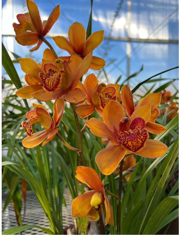
Cymbidiums at the South Shore Nursery, Hingham, Massachusetts, 2022