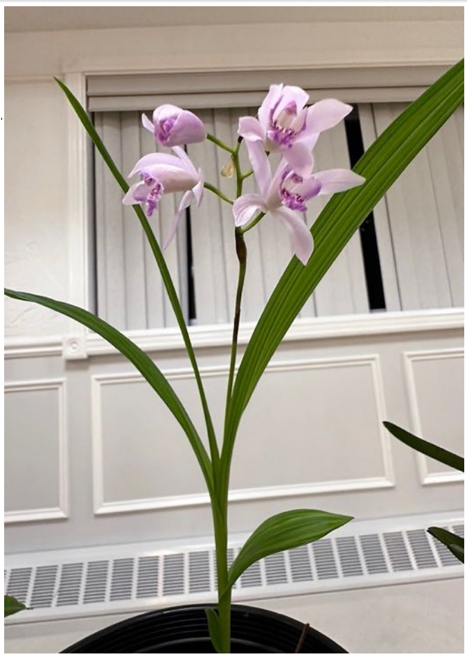
Bletilla striata 'Murasaki Shikibu'