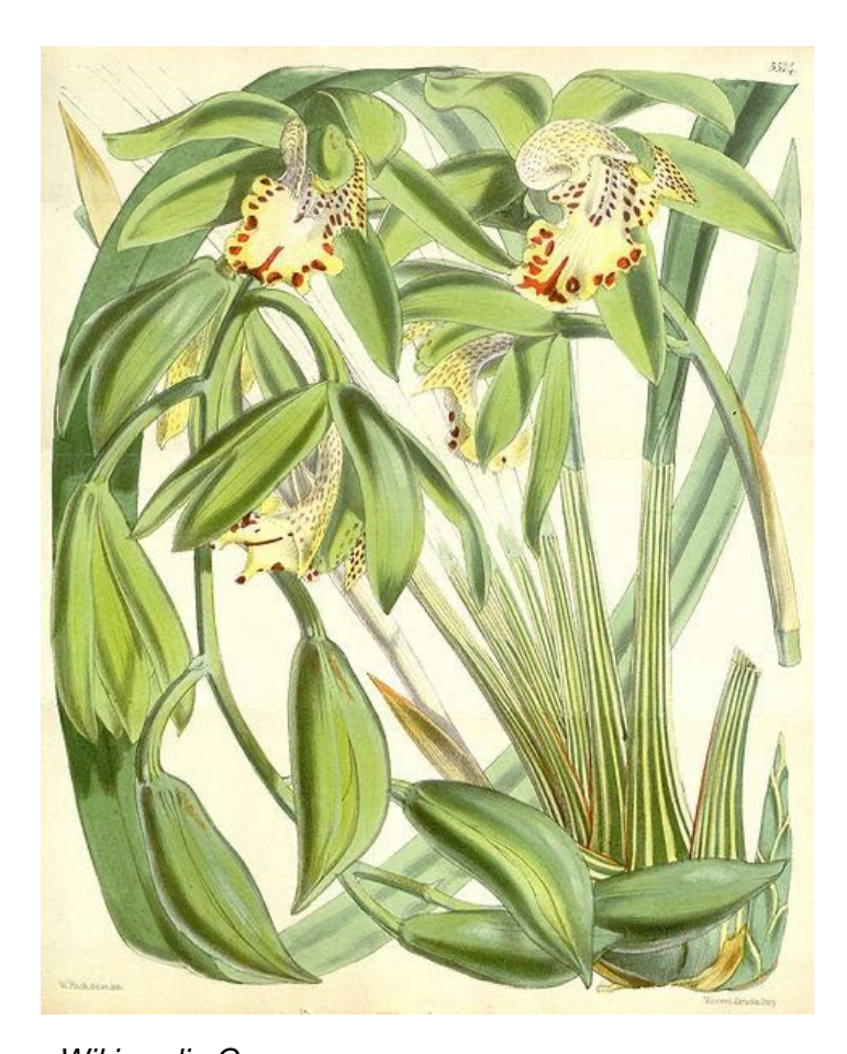
Wikimedia Commons Walter Hood Fitch (Scottish, 1817–1892), Illustration of Cymbidium hookerianum from Curtis's Botanical Magazine , vol. 92, London, 1866. Chromolithograph

Most commercially available Cymbidiums are hybrids derived from several species harvested from the foothills of the Himalayan mountains. British botanist and explorer Sir Joseph Dalton Hooker—a colleague of Charles Darwin—took an expedition to the Himalayas between 1847–1851. The first known European to collect plants in the region, Hooker harvested the Cymbidium species which were crossed to produce the hybrid Cymbidiums of today. Cymbidium hookerianum —named for the famed botanist— is a delicacy in Bhutanese cuisine. The pseudobulbs are eaten like potatoes. The flowers are boiled and cooked in traditional spicy curry.