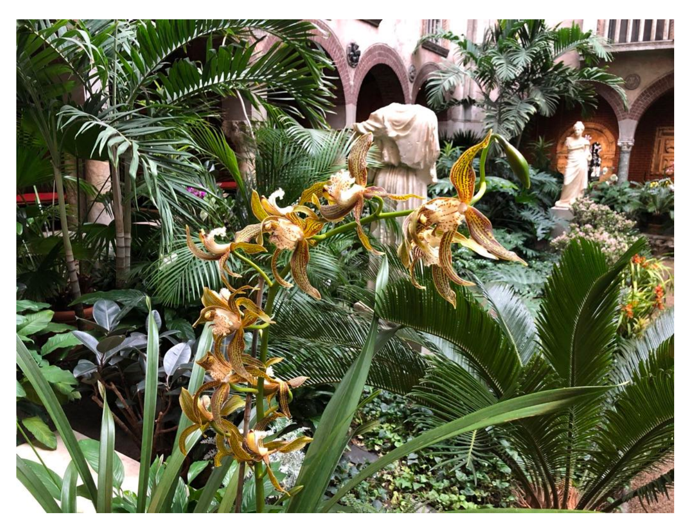
Midwinter Tropics display in the Courtyard of the Isabella Stewart Gardner Museum, 2021

During the coldest months of the year, a celebrated collection of tropical plants adorns the Courtyard of the Isabella Stewart Gardner Museum. This verdant display, known as Midwinter Tropics, features the brilliant inflorescences of exotic orchids. Among these, the Cymbidium stands out both for its elegance and historic significance.