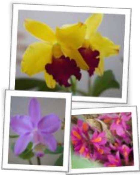
August show-table photos

Another fun and interesting way to learn more about orchids and help the society is to clerk! Friday morning, American Orchid Society judges and volunteer clerks are going to be judging the show. Clerking involves walking around the show with the judges talking orchids and orchid displays for a few hours. You even get lunch afterwards! There are three types of clerks in addition to a general clerk: pointer, ribbon clerk, and head clerk. Pointers will walk ahead of the group and will look for the tags of the plants the judging team is judging (did I mention that folks are divided into groups with two or three judges and three or so clerks and that each group will be assigned a different tribe of orchids or