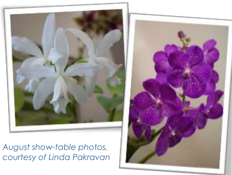
August show-table photos

Fred is offering a 10% discount for pre-orders with free shipping. Go to Sunset Valley Orchids to place your order.