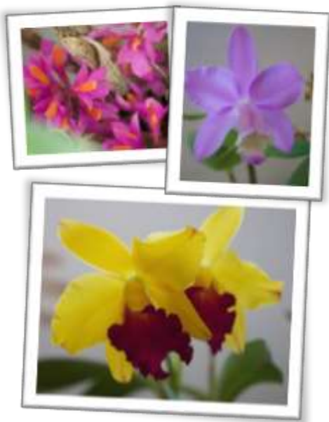
August show-table photos

I want to thank everyone who helped make the auction a success! Thank you if you participated at the auction by attending, buying, or helping. I would especially like to thank