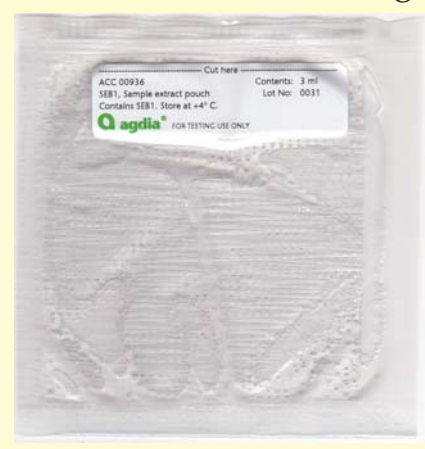
Step 1 Open the ImmunoStrip sample extraction bag.