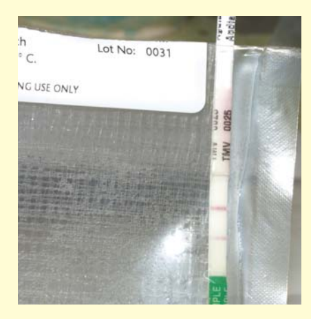
Step 4 Developing test strip.