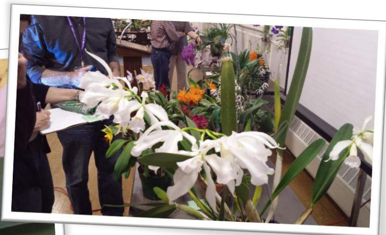
May show-table photos