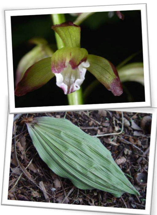
Close-ups of A. heymale's flower and single leaf.

Aplectrum hyemale is a wonderful example of the morphological variation found in orchids. It grows a single evergreen leaf in the fall which dies off around May, soon followed by a flower stem. The stem typically holds 8-20 brownish-purple flowers about ½ - 1 inch long.