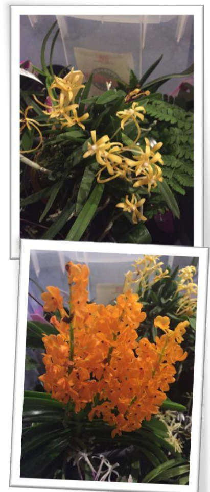
May show-table photos

Many thanks again to all the outgoing Board members, and welcome to our new folks.