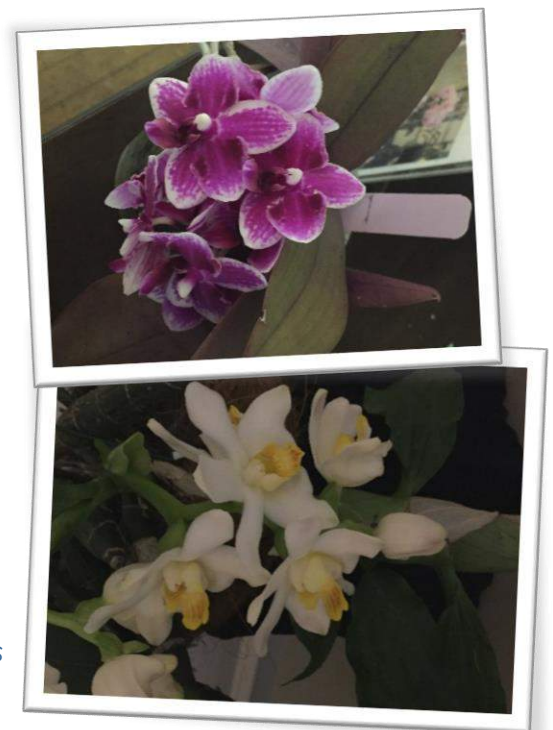
May show-table photos