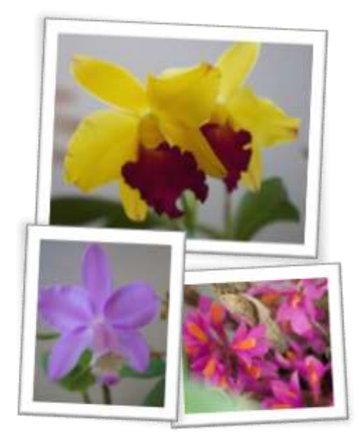
August 2016 show-table photos