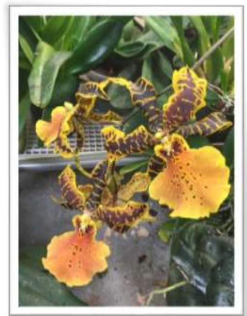
Alcra Hildo Ablaze 'Hilo Gold' HCC/AOS