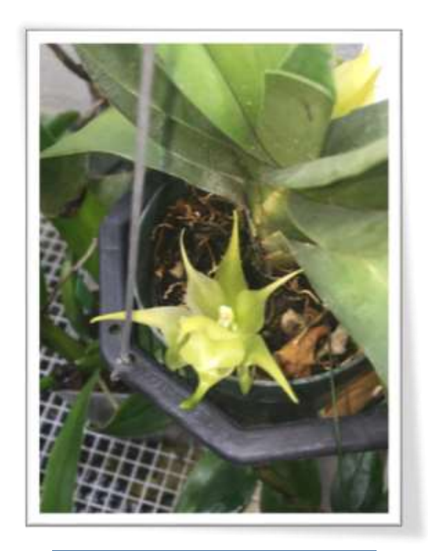
Aeranthes Hsinying ramosa

Monthly meeting starts at 7:30 p.m. Please have your plant on the show table by 7 p.m. Please bring a snack to share, you receive an additional raffle ticket if you do.