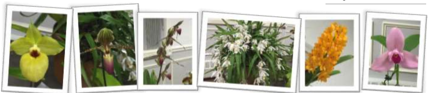
At left & below, various photos from the MOS show-table at the February meeting