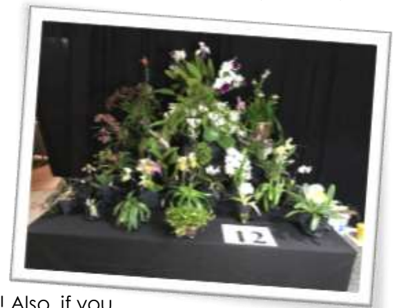
Above, the MOS display at the Amherst Orchid Society show, Feb 25-26