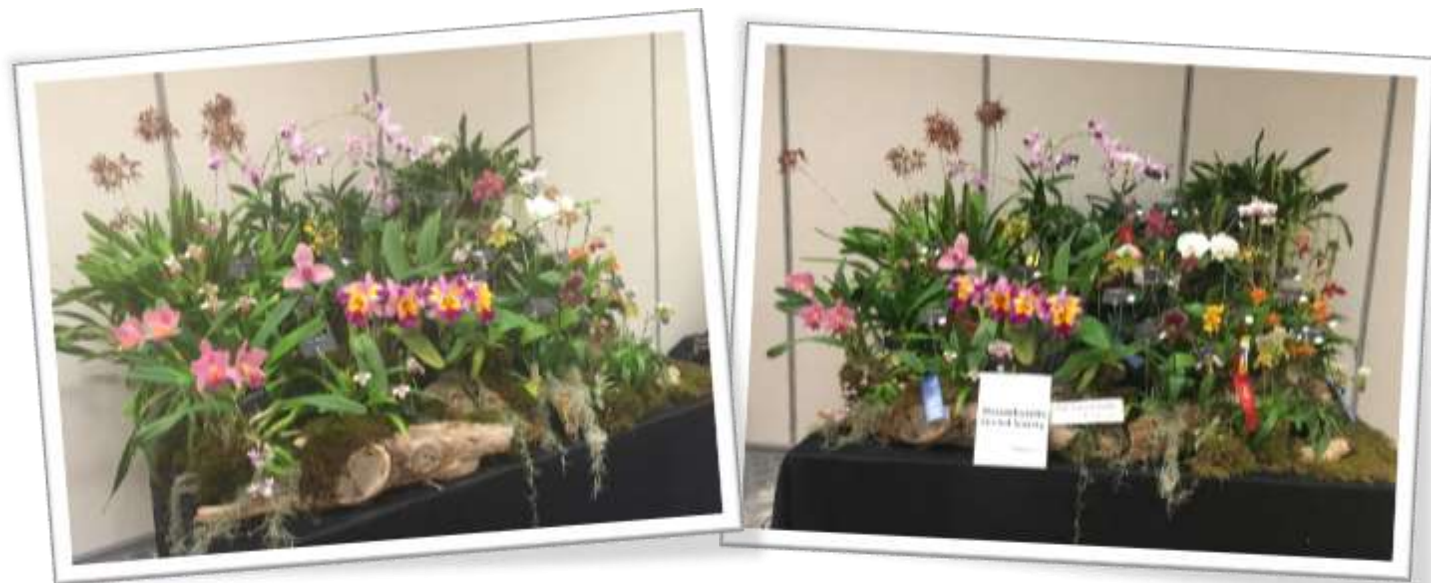
Above, two angles of the MOS display at the NHOS annual show. Neither sleet nor snow could stop Brigitte Fortin and Ralph DiFonzo from navigating up Route 3 and building a display that MOS members could be proud of!